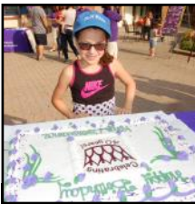
This young resident is ready for Birthday Cake!

KCCA would like to extend a great big thank you to everyone who helped celebrate the 40th Birthday of Kings Contrivance Village on June 15! Village board members, elected officials and many residents enjoyed live music, birthday cake, giveaways and a fantastic display of KC History! Thanks to KIMCO