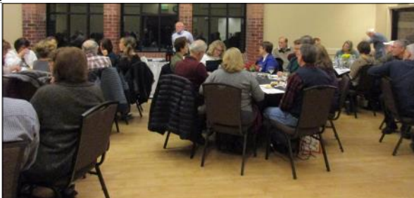
Wine Tasting event at Amherst House